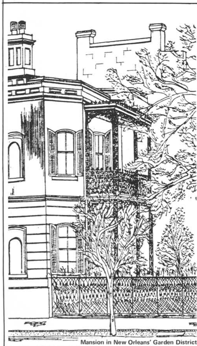
Mansion in New Orleans' Garden District